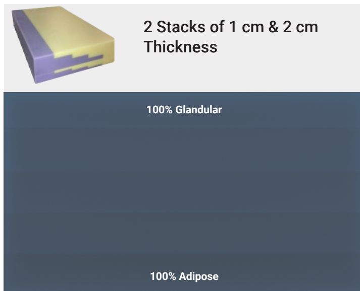
X-ray image of 1 cm + 2 cm stack

Combine the blocks of glandular/adipose together with the breast-iodine block, on a 2D projection, to obtain rectangular areas with 55 different combinations of iodine concentration and glandularity. Without the iodine block, the phantom can be used as a breast density reference, with 1 cm increments for breasts up to 9 cm thick.